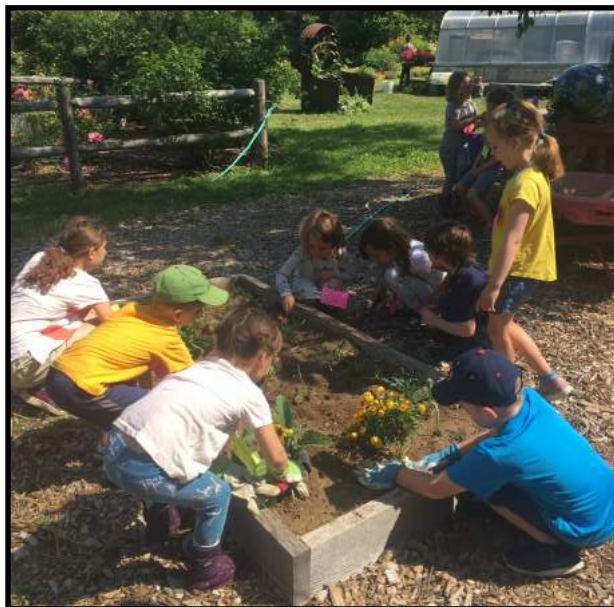
Little Sprouts plant the Children's Garden.

Parents can sign up online by visiting www.knox-lincoln.org/ecology-camp .