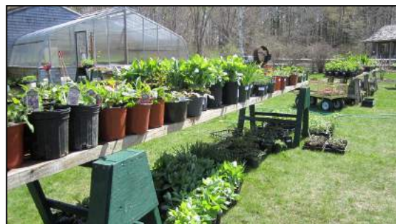
Annuals, perennials, vegetables, and herbs line the tables for easy shopping among the gardens at Merryspring.

This year's sale will also include some special guests – classic hostas and other shade plants from Fernwood Nursery and those wonderful dahlias from Endless Summer Flower Farm! Some divisions donated by Merryspring members from their own gardens will also be available.