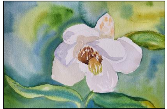
Watercolor by Marjorie Maxcy

BUSINESS FRIEND ($100 - $249): Hannaford Super Market.