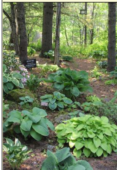
Hosta Garden at Merryspring.