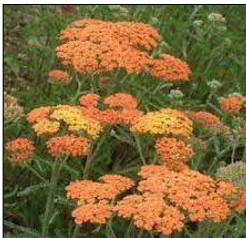
Achillea millefolium 'Terracotta' is one of many plants featured at the Plant Sale.