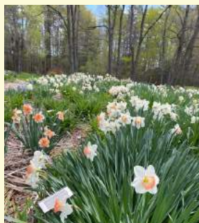
Daffodils make way for daylilies.

The Maine Daylily Society’s display garden is full of daffodils right now, so bring a picnic and enjoy the flowers! Daylilies and daffodils make great neighbors. Daylily foliage is sprouting up in the garden, along with the many daffodil varieties. The club has worked to bring a wide variety of unusual daffodils to the spring garden. Most of the Merryspring audience is aware that daffodil foliage has to mature before cutting or pulling. Meanwhile the daylilies push up beside it, masking the foliage, yet allowing for a pleasant coexistence. As the daylilies start to bloom in mid-July, the daffodil foliage is yellowing and can be cut or flattened and left to dry.