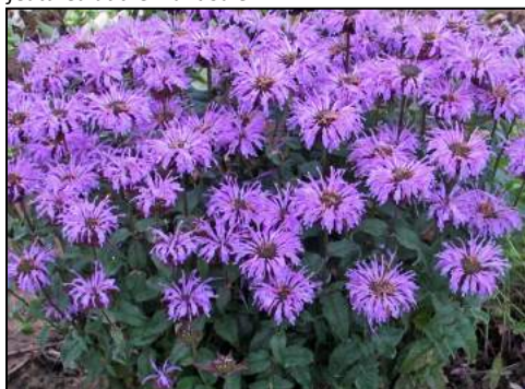
Pollinators will love 'Sugar Buzz Blue Moon' bee balm among many other pollinator-friendly plants available at the Plant Sale.

Merryspring will hold its Spring Plant Sale on Friday, May 12, from 3:00 p.m. to 6:00 p.m. and on Saturday, May 13, from 9:00 a.m. to 2:00 p.m.